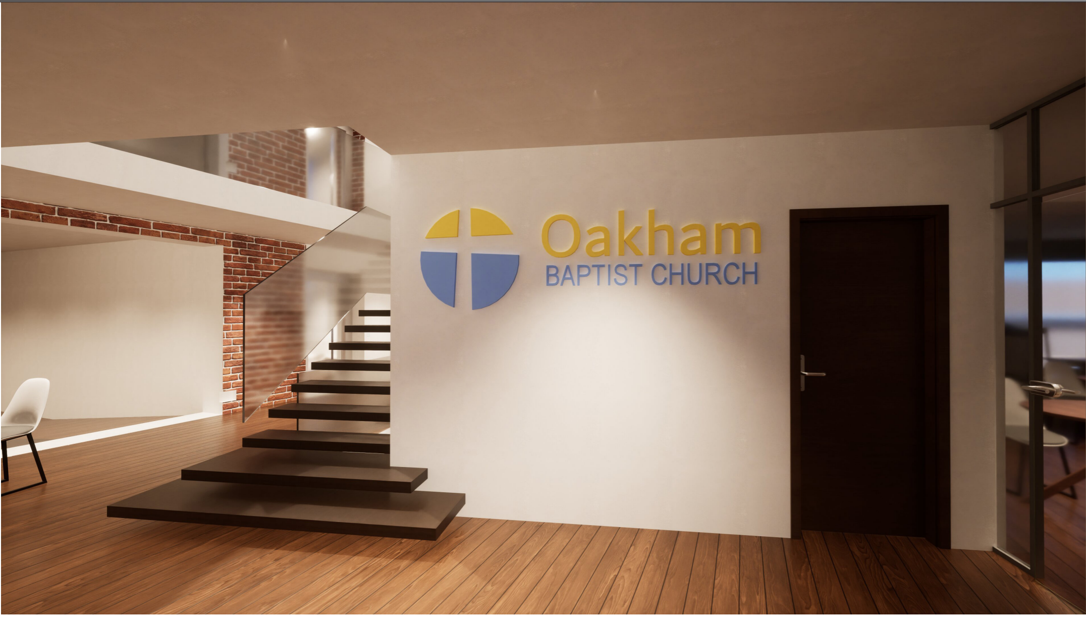
Main entrance lobby from the the door to Westgate car park