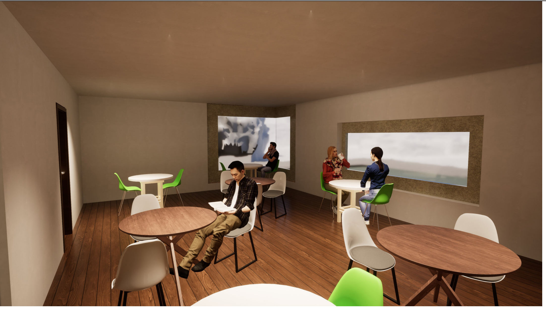
Artist's impression of how the new cafe space might be configured